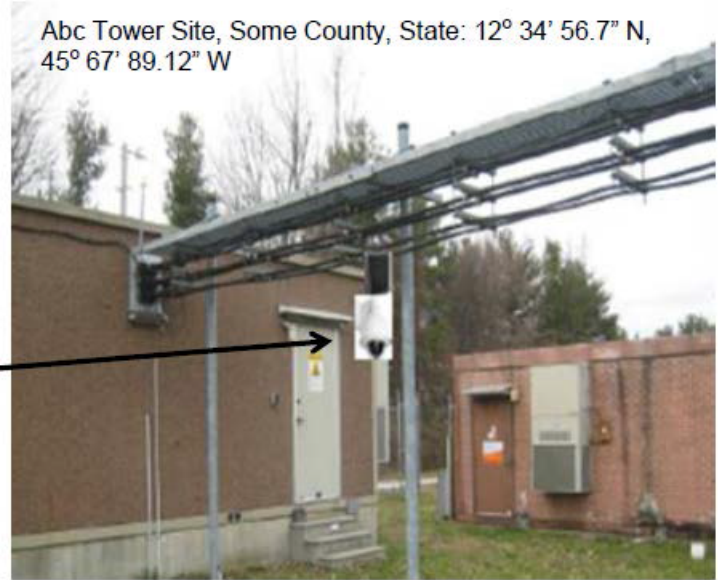
Figure 3. Ground-level photograph with graphic showing proposed equipment installation.

Ground-level photograph with excavation area close-up. The example in Figure 4 shows the proposed location for the concrete pad for a generator and the ground disturbance to connect the generator to the building's electrical service. This information can be illustrated with either an aerial or ground-level photograph, or both. This example has the name and physical address of the project site.